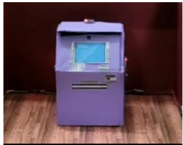
Fig3. Working module of system.

Using the RFID tag which is only accessible by the banking sector person can stop the system which is read by the RFID reader in the ATM machine.